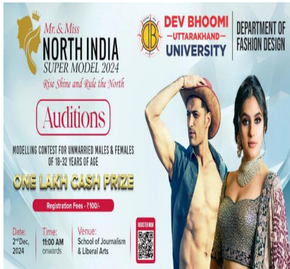
Poster of the event