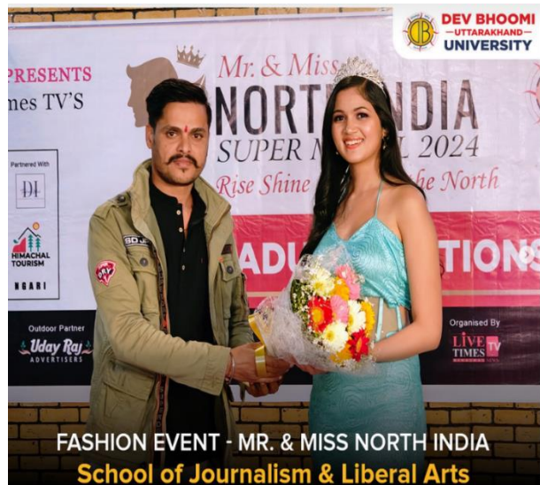
Welcome of the guest