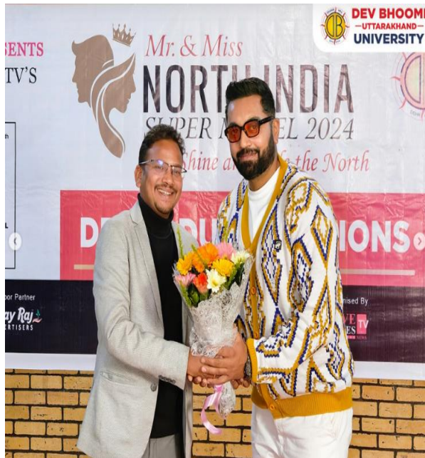
Facilitation of the guest